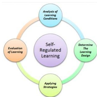
Figure 1: The implementation of Self-regulated learning

The results showed that self-regulated learning facilitates students SMAS Islam Miftahul Ulum, Krejengan, Probolinggo to learn Islamic education subject during the Covid-19 pandemic. The implementation of self-regulated learning can be described as follows: