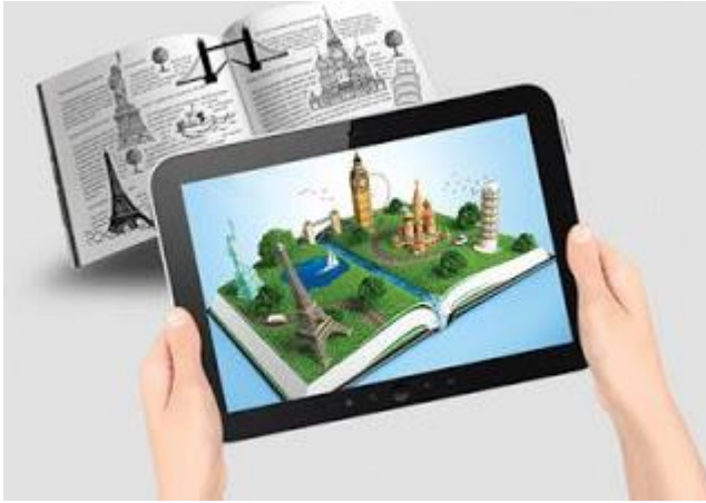
Figure 2 The example of Augmented Reality.

Based on object-tracking techniques, the augment system is divided into 3 types, namely positioning, marker , and markerless augmented reality services. The type of augmented reality positioning system is quite simple in its use. This system uses position as a marker , so it is usually combined with GPS on a smart phone. This type of augmented reality mark system uses techniques to detect markers that have been pre-programmed to be recognized. A marker is in the form of a square with a white background and with several black shades. These two colors are more often used because of the effect of light sensitivity on black and white so that it is easy to detect. This type of marker is commonly referred to as a static marker. But there are abstract forms. Marker types are often also categorized as markerless in the form of complex patterns consisting of writing, drawing, or color. This media enables the students to enrich their vocabularies, and also reading comprehension.