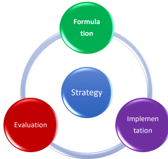
Figure 2. Principal's Strategy in Developing Entrepreneurship

From the figure above, the principal's strategy in developing entrepreneurship consists of three strategies with the following explanation: