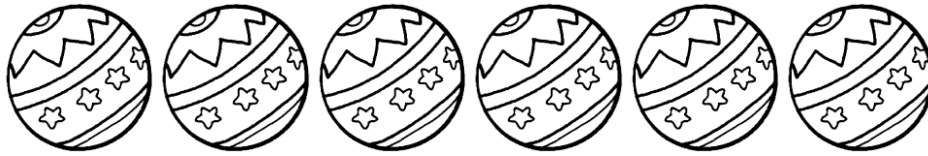
Figure 3. Shows an example of a colorless ball.

Some children focus too much on coloring and overlook the computation results when presented with a colorless picture like the one above, but this does not lower each child's concentration. The other child must insist on picking the color. This occurs when the teacher is too preoccupied with implementing the lesson plans to notice each child's condition. Because the teacher is less responsive and attentive, there is also a gap between the teacher and the child. Teachers must act as collaborators, mentors, and parents to their students. Other tactics, on the other hand, can eventually overcome this.