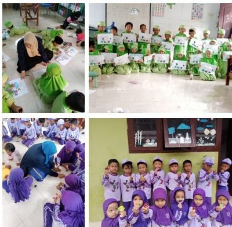
Figure 2. shows the naturalist illustration drawing method's process of learning. (documentation of researchers in the field)

Teachers, as educators, must take an active role in implementing learning models to assist pupils in focusing on their studies. This will have an impact on student learning outcomes. As a result, visual media usage in the classroom improves children's concentration. There are various factors to consider while choosing picture media, including each student's personality, the features of the material, and the child's learning environment.