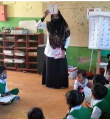
Figure 3. Classic card demonstration