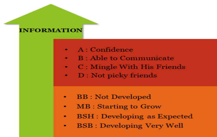
Figure 3. Development of Introvert Children

Evaluation often understood in education, is limited to assessment only (Fitrianti, 2018). This assessment is carried out in a formative and summative manner. When an evaluation has been carried out, it is considered to have conducted an evaluation. Such understanding is not very precise. The implementation of the assessment tends to only look at the achievement of learning objectives. In this case, in the educational process, it is not only the value that is seen but many factors that make a program successful or not. Assessment is only a small part of the evaluation. Evaluation should also be understood as part of supervision. Evaluation does not only deal with the value measured based on the completion of questions, but the evaluation of educational programs will examine many factors (Daud et al., 2020). Thus program evaluation needs to be introduced to all educators because evaluation is very important in developing the quality of education (Ashiong P. Munthe, 2015). Evaluation can encourage students to be more active in learning continuously, encourage teachers to improve the quality of the learning process further, and encourage schools to improve additional facilities and the quality of student learning (B, 2017).