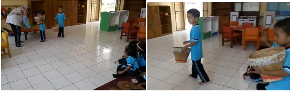
Figure 2. Role-Playing Game (Farmers' Role)

Based on the documentation obtained when using role-playing, it can be seen that an increase in introverted children's interactions with the environment is more communicative and mingling.